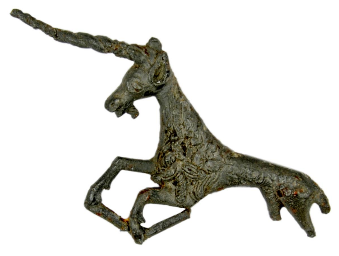
Zoomorphic mounting in the form of a unicorn found in the Trakai Peninsula Castle area